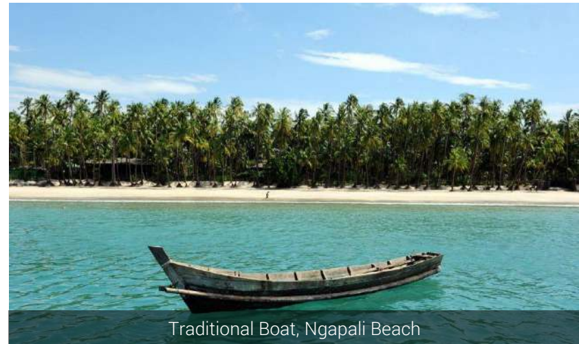
Traditional Boat, Ngapali Beach