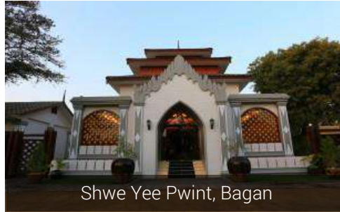
Shwe Yee Pwint, Bagan