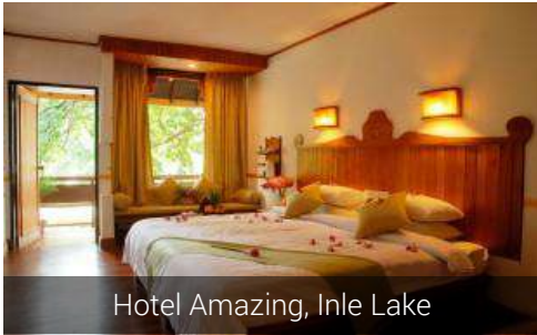
Hotel Amazing, Inle Lake