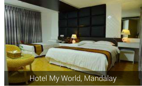
Hotel My World, Mandalay