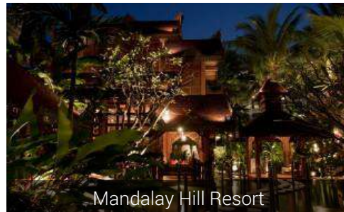
Mandalay Hill Resort