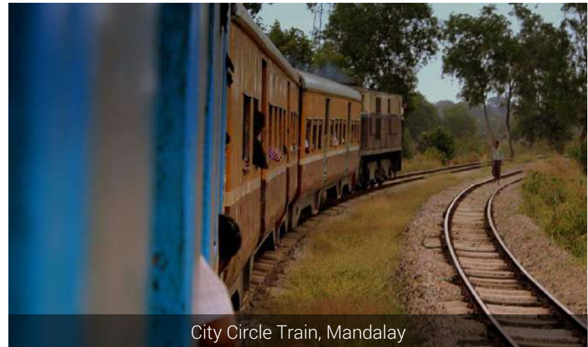
City Circle Train, Mandalay