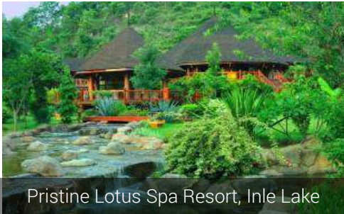
Pristine Lotus Spa Resort, Inle Lake