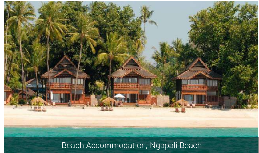
Beach Accommodation, Ngapali Beach