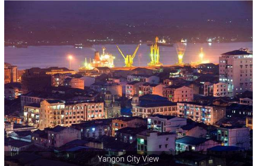
Yangon City View