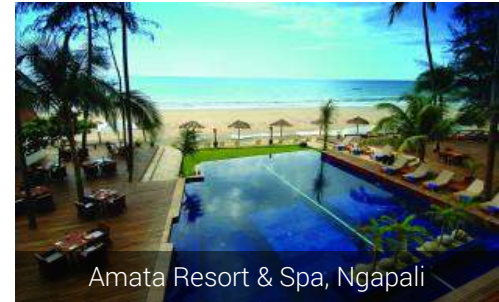
Amata Resort & Spa, Ngapali