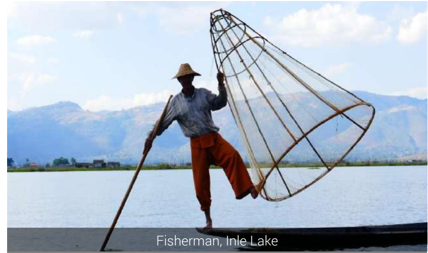
Fisherman, Inle Lake