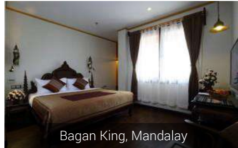
Bagan King, Mandalay