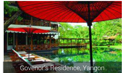
Govenor's Residence, Yangon