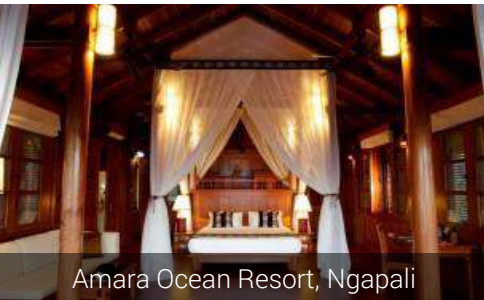
Amara Ocean Resort, Ngapali